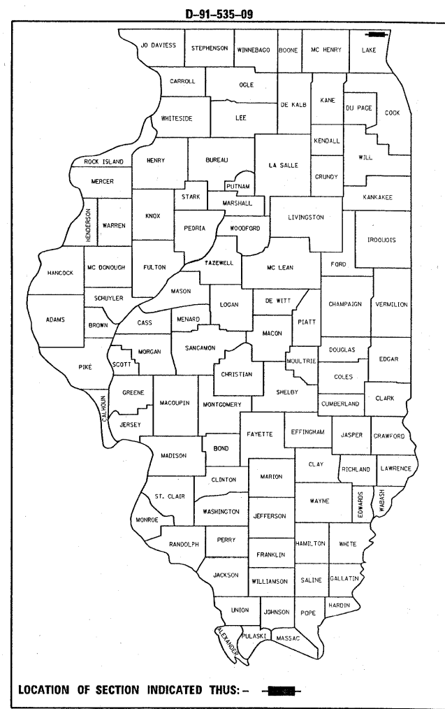
LOCATION OF SECTION INDICATED THIS: - [shaded area] -