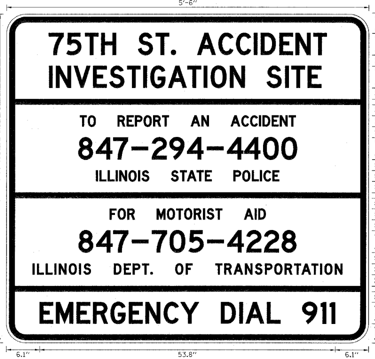
75TH ST RAMP, STA. 7130+38