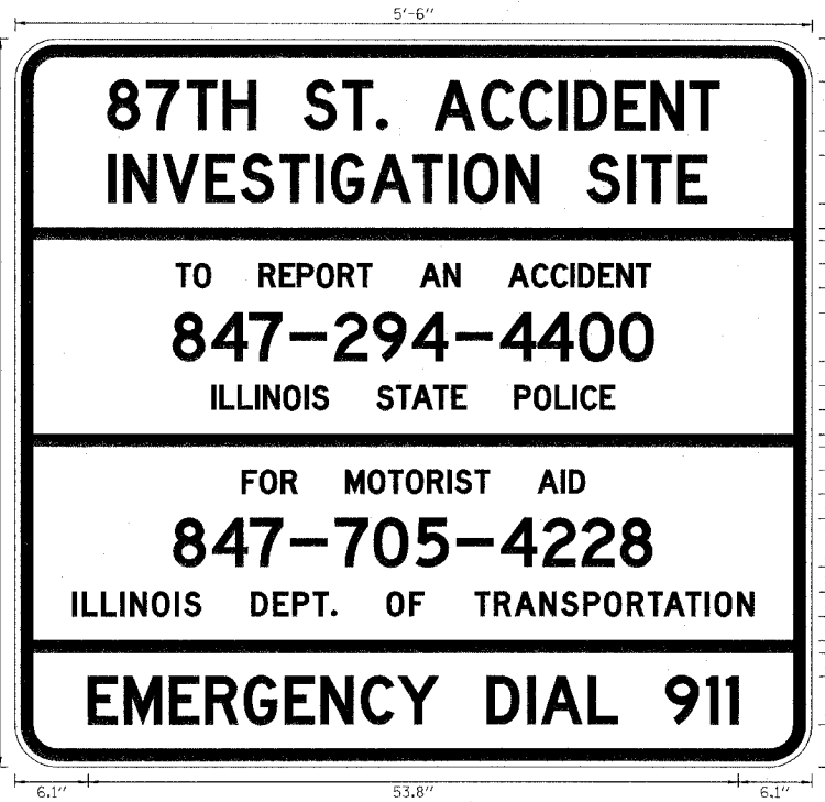
87TH ST. RAMP, STA. 7183+50