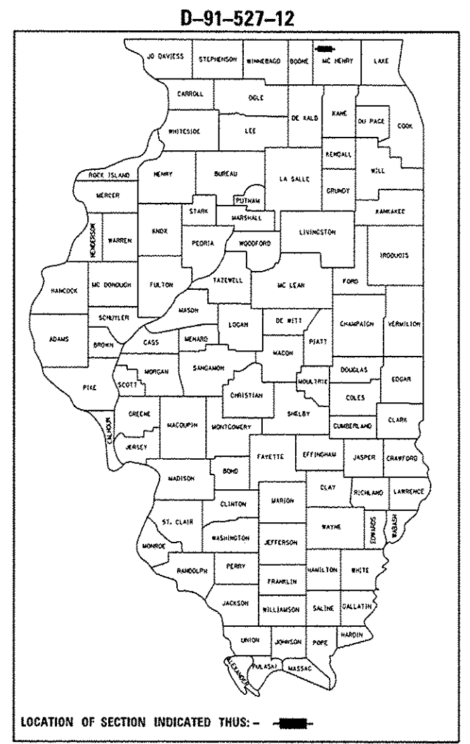
LOCATION OF SECTION INDICATED THUS: - [shaded area] -

GROSS LENGTH = 18,321 FT. = 3.47 MILE NET LENGTH = 14,226 FT. = 2.69 MILE