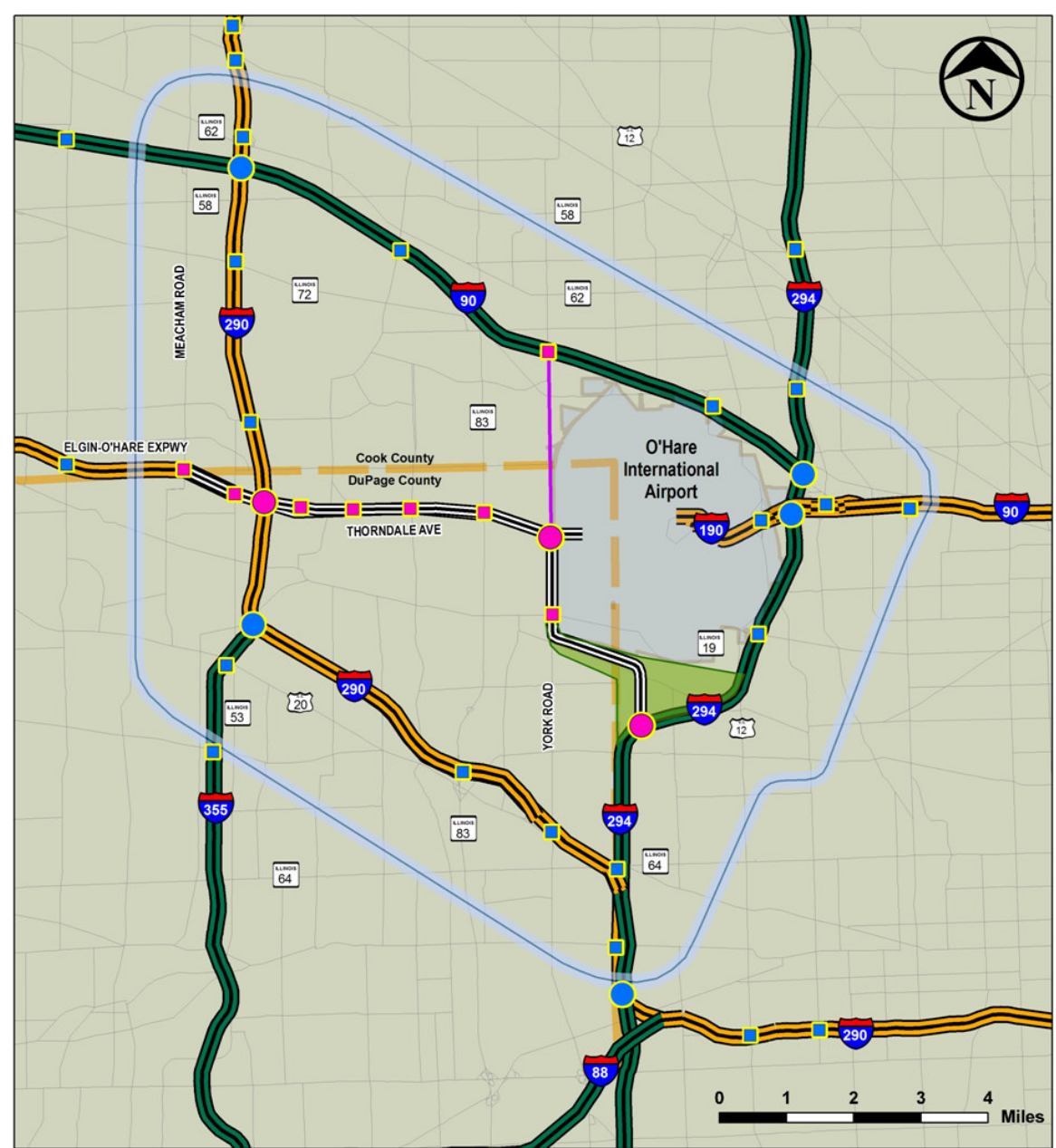
Group 4, Option 3 (Strategy 403)